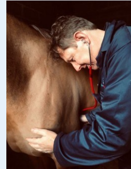
Checking the heart rate

Heart Rate (HR) is commonly measured in horses by placing a stethoscope behind the left elbow, listening for 30 seconds, and doubling the count for beats per minute. A typical adult horse has an HR of 36-40 bpm; fit horses may have lower rates, while ponies are usually higher. Concern arises if HR approaches 60 bpm, as pain, illness, or heart issues can increase it. Knowing your horse's usual HR is helpful. Consider buying an inexpensive stethoscope to monitor it regularly. Taking a pulse by feeling an artery is possible, but measuring HR with a stethoscope is simpler.